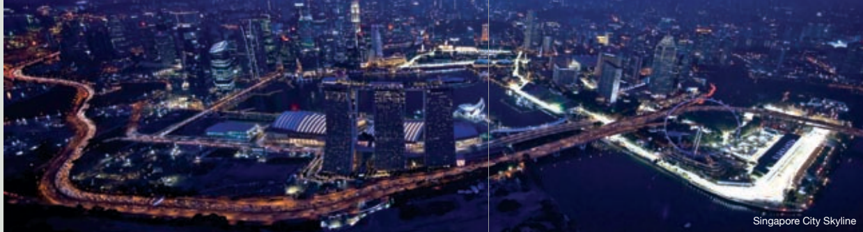
Singapore City Skyline