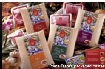
Prima Taste's packaged pastes

For symbolic memories of your Singapore visit, pick up RISIS' famous gold-dipped orchids (Singapore's national flower) available as pins, earrings, pendants and many other accessories.