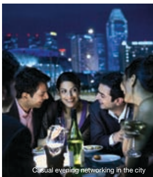
Casual evening networking in the city