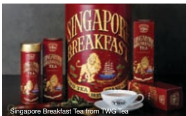
Singapore Breakfast Tea from TWG Tea

Opening Hours: Saturday to Tuesday, 7am to 5pm, Wednesday to Friday, 7am to 7.50pm